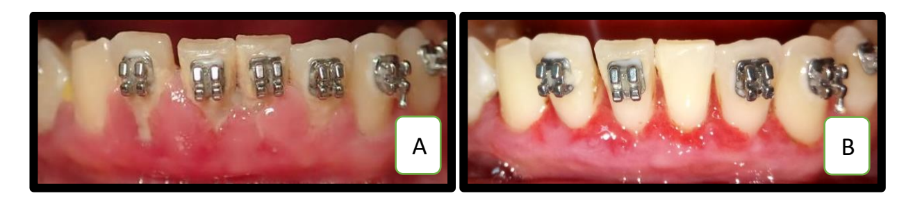
Figure 3. One week post scalpel surgical gingivectomy and gingivoplasty on mandibular anterior: (A) before scalpel surgical gingivectomy and gingivoplasty, (B) after condition scalpel surgical gingivectomy and gingivoplasty

inflammation of the gingiva. Patient was happy and satisfied with the outcome of the therapy.