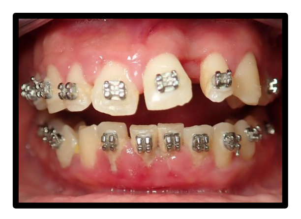
Figure 1. Swelling gingiva

history or general medical history was reported. Additionally, there was no family history. Clinical examination revealed Grade II gingival enlargement in mandibular anterior. (Figure 1)