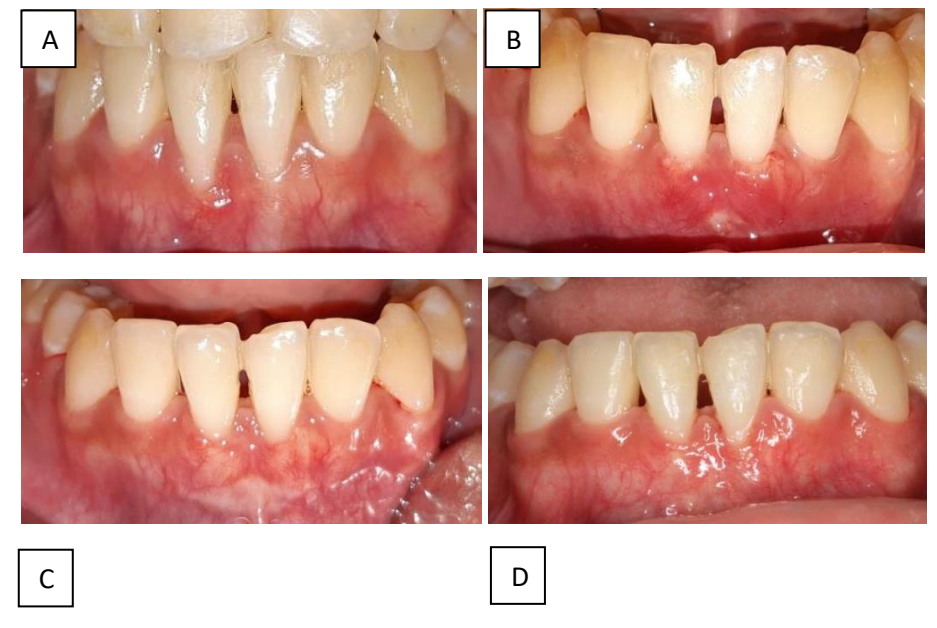
Figure 3. (A) Pre operative condition; (B) 14 days post operative; (C) 1 month post operative; and (D) 2 months post operative.

operative care, the patient was told to apply hyaluronic acid gel three times each day. After one week following surgery, the patient was summoned back. Suture removal was done after two weeks post operative.