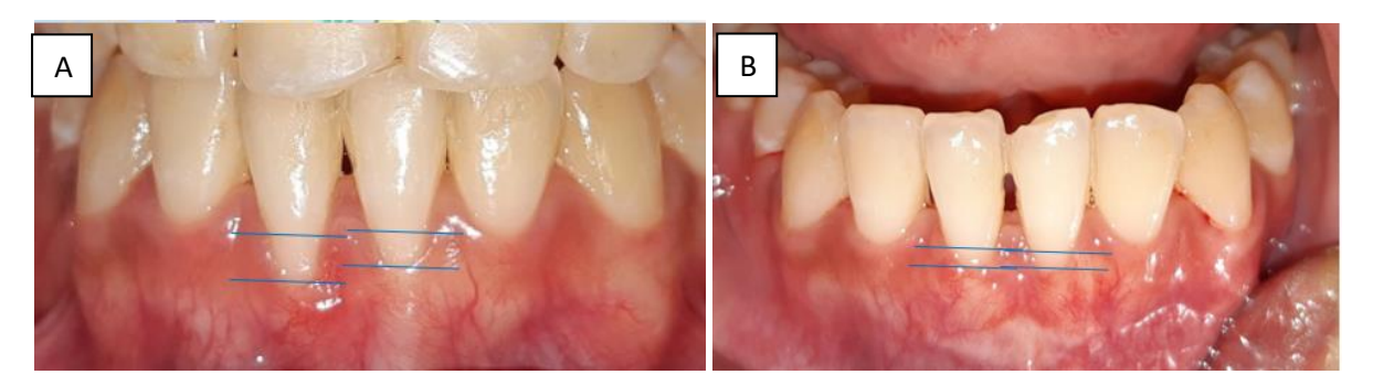
Figure 4. Before and after surgery: (A) Gingival recession before surgery and (B) Gingival recession conditionafter surgery.