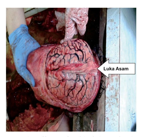
Figure 3. The effects of acid violence in the brain (Edema)