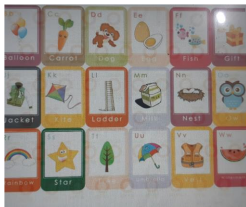
Figure 1. Paper flashcards used by teachers in teaching English

The finding of the study is strengthened by the documentation of paper flashcards used by English teachers in introducing English vocabulary to students in elementary schools. This is evidenced by the following figure.