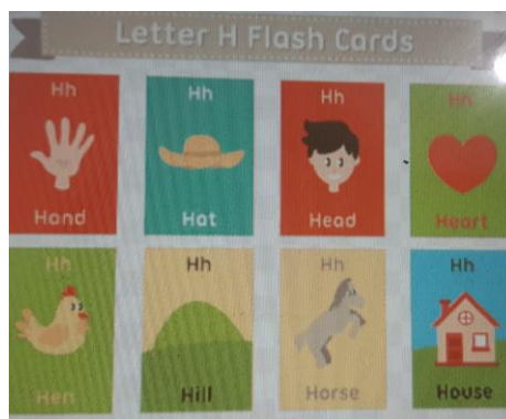
Figure 3. Letter H Flash Cards

The finding is also strengthened by the following documentation of using paper flashcards in enriching students' English vocabulary.