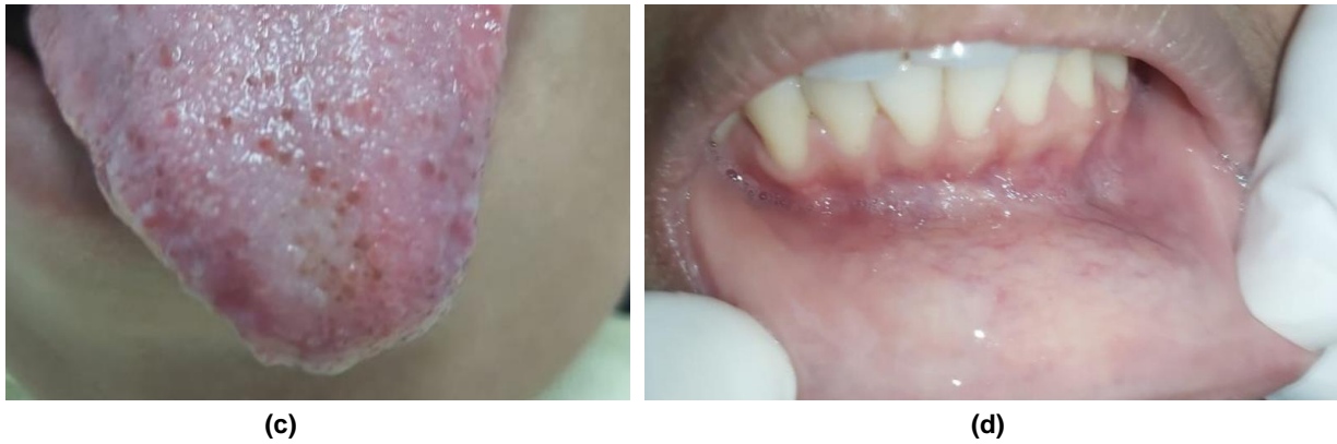
Figure 2. Healing of the ulcerated area ; right buccal mucosa and gingiva(a), soft palate and new ulcer aroused on left oropharynx(b), anterior dorsum of the tongue(c), muco buccal fold(d)