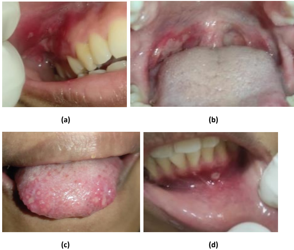
Figure 1. Shallow multiple irregular ulcer ranging from 0.5 to 3 cm in diameter with erythematous border, located on right buccal mucosa and gingiva (a), right soft palate (b), anterior dorsum of the tongue (c), muco buccal fold (d)

used twice daily and multivitamin to be taken once daily.