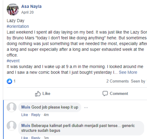
Figure 4. Students' writing result on Group's wall

In this Cycle, the English teacher showed how the implementation of Facebook Closed Group takes places in this research. The teacher had had a Facebook account and were added into the group. In this cycle the teacher took over the group and started giving his students a feedback and motivation to keep them learn more next time. This act can be seen from the figure on the next page.