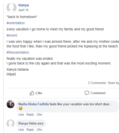
Figure 4.2. The students writing result on groups’ wall

Before the implementation, the important point that researcher need to view in order to prove that this research was succeed happened before the class. That was the action that happened on Wednesday or the deadline day of students that need to submit their work on the group’s wall. It is the important point because this act was the main part of this research. In this part of implementation, the students made and submit their work on the groups’ wall and the researcher gave them some feedback on error that they made or supported them through complement and asks them to work harder next time it can be seen from the figure on below.