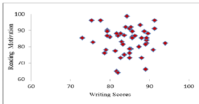
Figure 1. Correlation between students' reading motivation and writing achievement

there was no prediction could be made for a value of reading motivation and writing achievement. The negative correlation showed in figure 3 which all the dots lie on the line falling from the upper left-hand side to the lower right-hand side (Roeve, 2017).