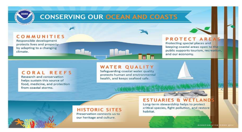
Figure 4. Official website of U.S Government: National Ocean and Atmospheric Administration U.S Department of Commerce