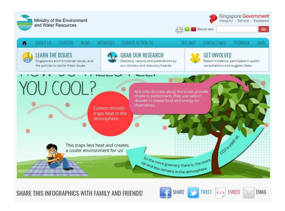
Figure 3. Official website of Singapore Government: Ministry of the Environment and water resources