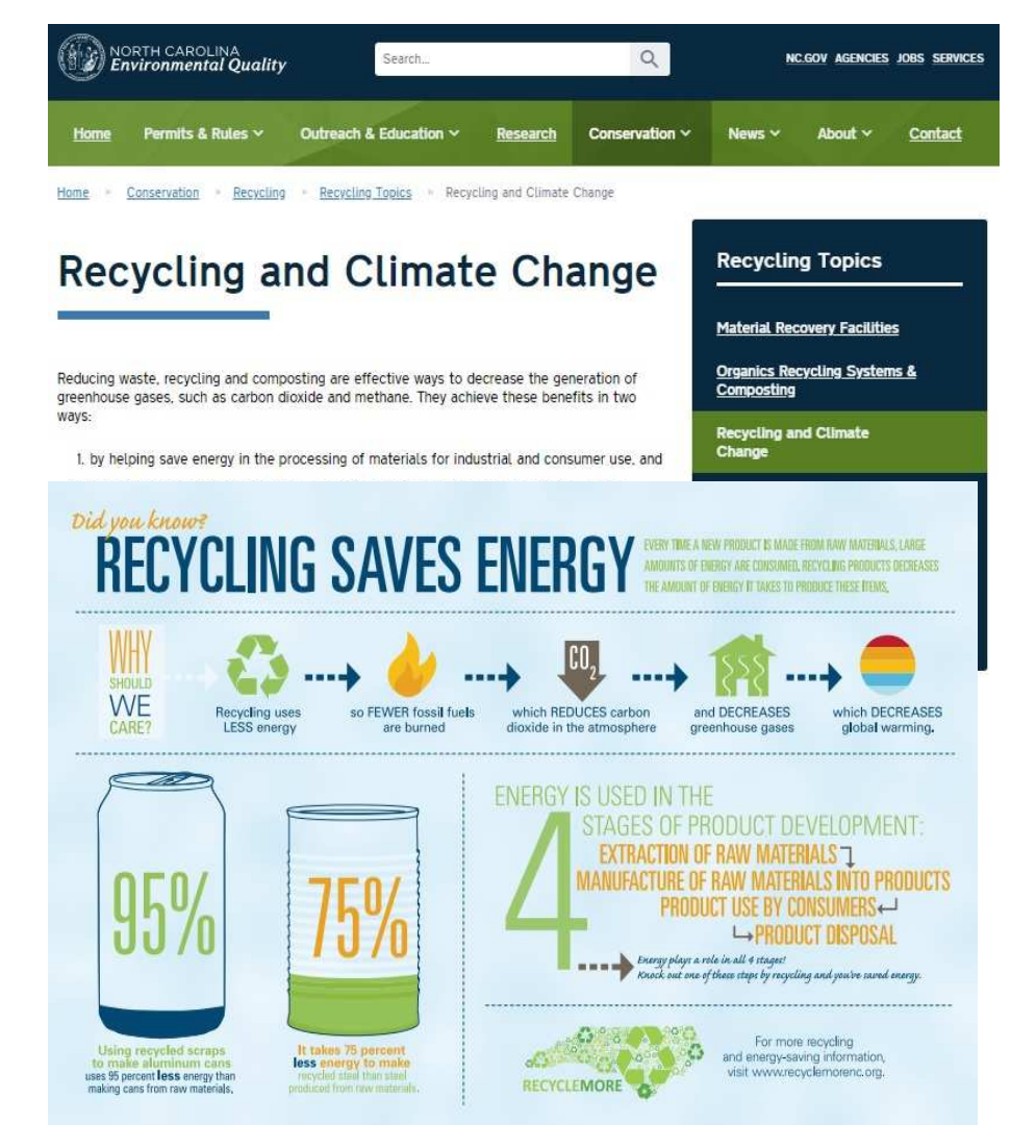
Figure 5. Official website of North Carolina Government: North Carolina department of environmental quality