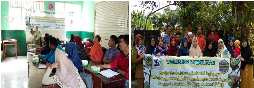
Picture 3. Workshop and Learning

This is in accordance with Law No. 12 of 2012 article 1 paragraph 9 that lecturers must carry out the University Three Dharma namely carrying out educational activities, research and dedication and guidance of the competence of teacher is an effort to educate the nation. In addition to government regulations no. 19 of 2005 concerning national education standards that education personnel must have pedagogical competencies including: 1) teacher's understanding of students, 2) design and implementation of learning, 3) evaluation of learning outcomes, and 4) development of students to actualize their various potentials.