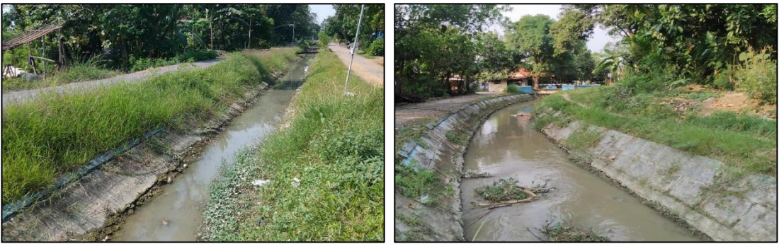
Fig. 4. Existing Condition Hm 58+00