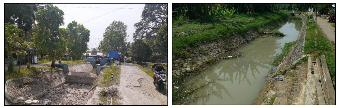
Fig. 2. Existing Condition Hm 00+00