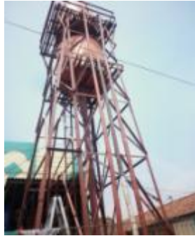
Fig 7. The shape of “Sumur Artesis”