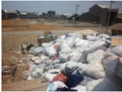
Fig 10. Sewage treatment by one of the residents