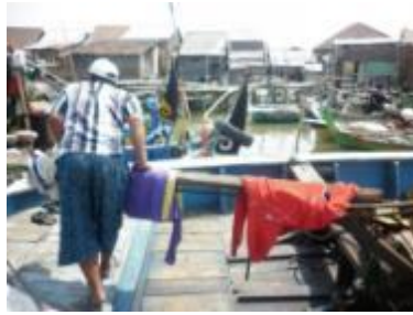
Fig 2. Parking place boat