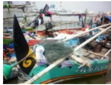
Fig 3. The types of boats used