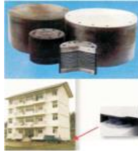
Figure 18: Rubber pads Technology and Its Application in Earthquake Resistant Buildings

hole pillar (15 cm). Rubber pads will Reduce of a direct impact between the pillar and foundation that can make the buildings above are not balanced or even damaged.