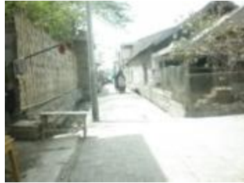
Fig 8. Paving road conditions

Tambak Lorok road conditions still need much improvement. Almost all the way there is of paving or soil. And because people do not understand, then they lifted up the road together so that the streets are not flooded. However, it will make their home will be lower than the road.