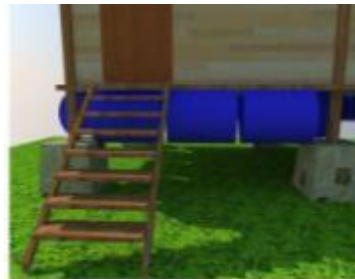
Figure 19: Buoy Placed Under House Flood

Buoys in residential buildings is placed under the floor of a house and has a function that occurs when the flood happen so the building will go up and the water does not get into the house. Size used in the design of this house diameter of 50 cm and the hight 83 cm.