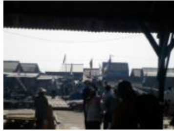
Fig 15. Old TPI