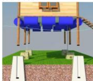
Figure 20: Chain hook Placed in the Lower House. Serves As The increase in water Exceeds Buffer Pole Hole In The Foundation

The function a chain hook on this house is event of a flood and rob a very large (more than 2 meters) and house floating stage up so high that the main column pole \pm 1.3 meters originally embedded in the foundation up and exceed these limits . With this chain hook, houses floating stage will stay in the starting position and not swept away in the event of floods and tidal.