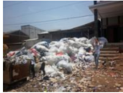
Fig 11. Sewage treatment by one of the residents