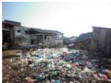
Fig 12. A pile of garbage next to the house