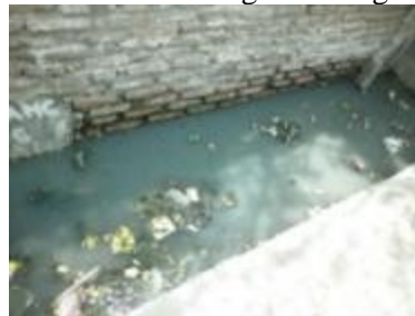
Fig 6. Drainage full of trash

Tambak Lorok drainage system can be said to be very bad, because in every ditch or stream disposal there full of rubbish. And it makes the flow is not smooth and clogged drainage. And it is one of the factors of flooding in the region.