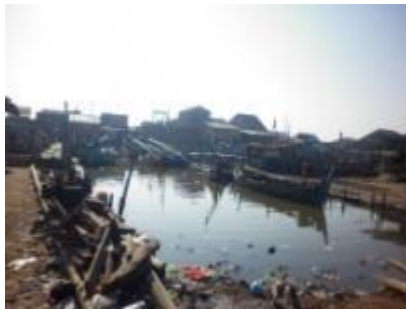
Fig 4. Personal boat