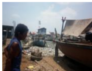
Fig 13. Garbage on the water