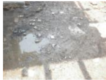
Fig 9. Dirt road conditins