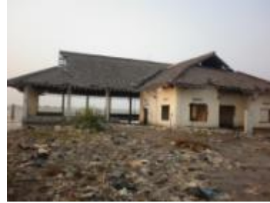
Fig 16. New TPI