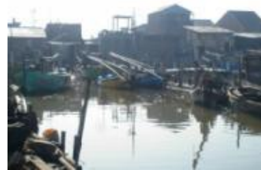
Fig 5. Other personal boat