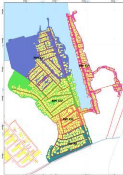
Figure 1. Map of Tambak Lorok