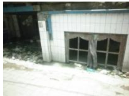
Fig 14. The house should be abandoned because it was submerged by water