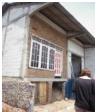
Fig 13. One of the houses to be elevated due to a decrease in soil

Land subsidence in Tambak Lorok is very bad, even the people who live there have to elevate his home on average 2 to 3 times per 5 years. Even then if they have the money to renovate their homes.