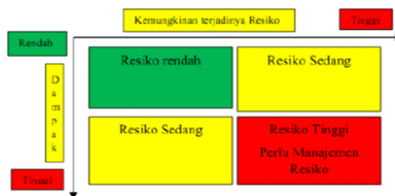
Picture 2. Level of Risk Clarification

Risk management means a process of measuring and controlling the risks that are likely to occur to a particular construction business activity. In risk management some types of decision-making are required. The image below compares the probability of an event with its effect.