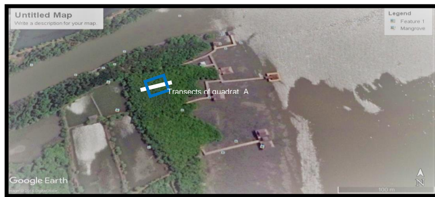
Fig. 1. Sampling location in quadrat A

Transect quadrat sampling method was a sampling method of a population with a sample plot approach that was on a line drawn through the ecosystem (KepMen LH 201, 2004). The dimension of one quadrant was 10m x 10m. Figure 1 showed the sampling location and Tabel 1 showed types of samples for every point sampling location.