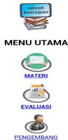
Figure 2. Main menu of E-book