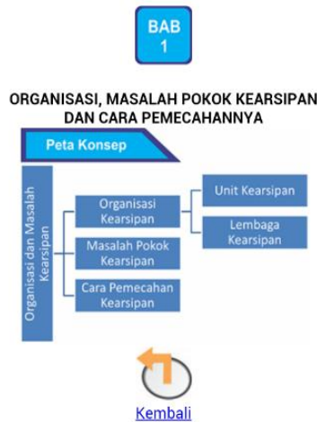
Figure 3. Concept Map