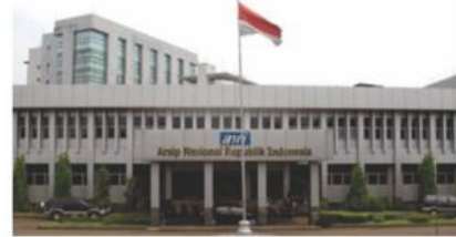
Gambar 1.2 Kantor ANRI lembaga kearsipan nasional