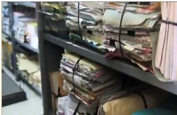
Pengaturan Arsip Kacau