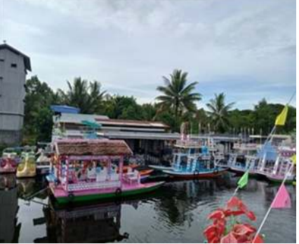
Figure 2 Locations before and after the Gubang Park tour