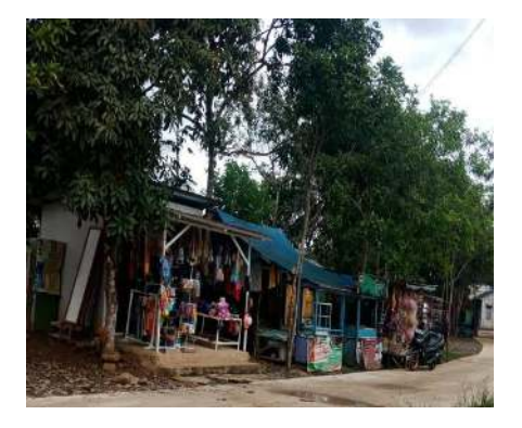
Figure 4. Gubang Park Souvenir products and locations

There is no difference in the prices offered for domestic and foreign tourists. Starting from the entrance ticket at each pier spot starting from 5000-10,000. The price for using the sea route or ferry is around 3000 for motorbikes and 5000 for cars. Price for motorbike