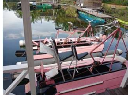
Figure 3. Gubang Dua Hull rides, Ducks and Water Bikes

Apart from the Gubang, they also provide water bikes that can be ridden by two people, there are various types, namely Gubang Park water bikes, okay water bikes, early water bikes, waterwheel water bikes and there are ducks. Gubang Park's strategy is to continue to innovate in developing other attractions to fulfill water tourism attractions to attract visitors. There are differences between the water bikes at Gubang Park and other tourist attractions, starting from the different types of water bikes at Gubang Park, the wood used is meranti wood which is taken from the Muara area, Kutai Kartanegara