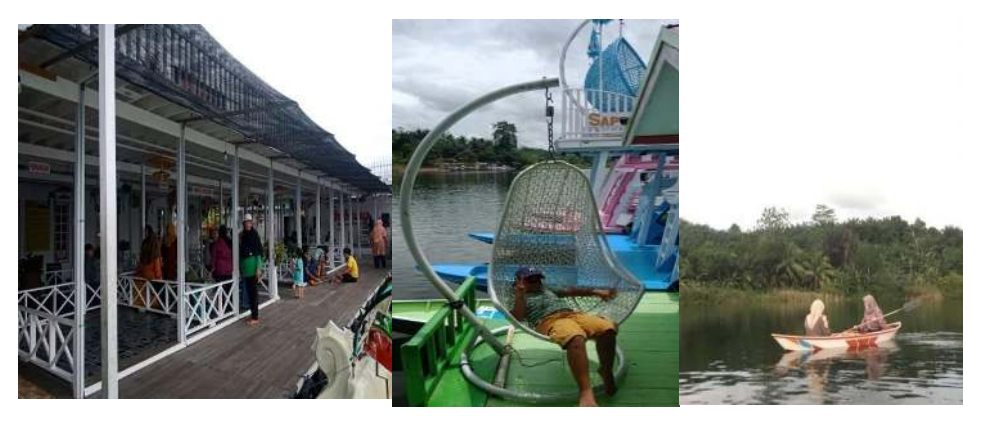
Figure 6. Gubang Park Visitor Documentation

happens due to several factors such as distribution through visitors' social media or from Taman Gubang. The unique location of Gubang Park is that it utilizes former coal mining pits to become a tourist destination which is only found in Kutai Kartanegara Regency. As well as the vehicle being modified into two hulls, it makes visitors curious about its shape and function..