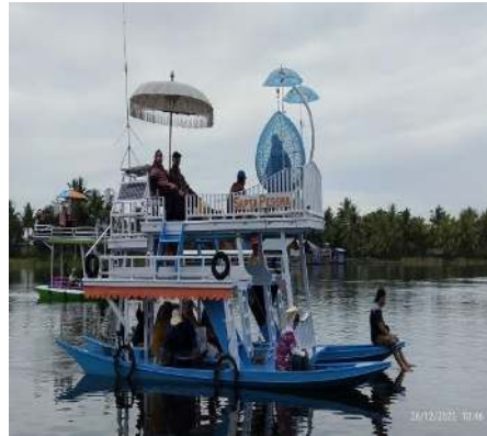
Figure 2. Difference between Original Gubang and Two Hull Gubang

The double-hull Gubang ride in Gubang Park has various names, namely Gubang Kembar, Langit Timur, Sapta Pesona, Intan Pesona, Etam Culture, Nuansa Behari and Baharu. The difference between each Gubang lies in its ornamentation and shape. Like Gubang Sapta Pesona and Gubang Nuansa Behari where Gubang Sapta Pesona is made of 2 levels. The rate for various types of double-hulled sheds is 100,000 per round, if you want to stop by another dock spot using the shed, you will be charged an additional fee of 50,000.