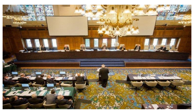
Figure 3. Permanent Court of Arbitration at the UN

The basis of China's territorial claims over nearlythe entire waters of the South China Sea in facthas been broken by the United Nations (UN) decision in 2016. This started after Indonesia's neighboring country, the Philippines, filed a lawsuit at the International Arbitration Court or the Permanent Court of Arbitration (PCA), which is a legal institution under the United Nations. The PCA has made a decision regarding the dispute in the South China Sea submitted by the Philippines, even though China has firmly rejected the PCA's decision. In fact, from the start China rejected the Philippines' lawsuit, arguing that the lawsuit was a confrontational way to resolve disputes. China's absence at trial, as confirmed by the PCA, does not reduce PCA's jurisdiction over the case. Even though the lawsuit was filed with the PCA by the Philippines, the decision has implications for ASEAN countries which have so far been in dispute with China in the South China Sea.<sup>19</sup>.