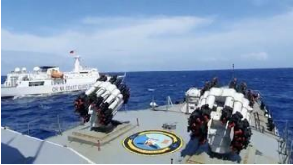
Figure 2. Chinese Coast Guard ships in the Natuna Sea Based on Article 9 of Annex VII UNCLOS, it is stated that the

The People's Republic of China (PRC/State of China) on 19 February 2013 and 1 August 2013 stated that they did not agree with the arbitration process and would not participate in the proceedings of the Arbitral Court that was formed. China does not agree with the settlement through the Arbitration Court because in the Declaration of Conduct (DOC) the claimant countries have agreed to resolve the South China Sea dispute to be resolved through a negotiation mechanism between the parties or with the ASEAN forum. Therefore China will not participate or participate in the Arbitration Court. The absence of a party to a dispute in the arbitral tribunal may be permitted pursuant to Article 3 (c and e) of UNCLOS Annex VII. Even though he was not present at the trial, China retains the right to follow and accept any developments in the trial. In addition, the rights of parties who are not present must still be considered and respected in the trial process.