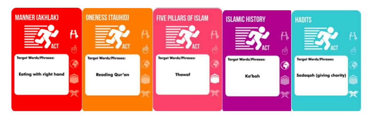
Figure 5. The 'acting cards' of the trivia cards

After been developed, the trivia cards with Islamic content were validated by one media-language expert and one content expert. Afterwards, the trivia cards were implemented in Islamic Law class, then students were asked their opinion towards the cards. Here are the results of the research: