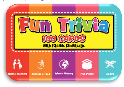
Figure 3. The front side of the trivia cards

In each topic among the five highest topics chosen, the trivia cards are developed into 25 cards, thus, they make 100 cards in total.