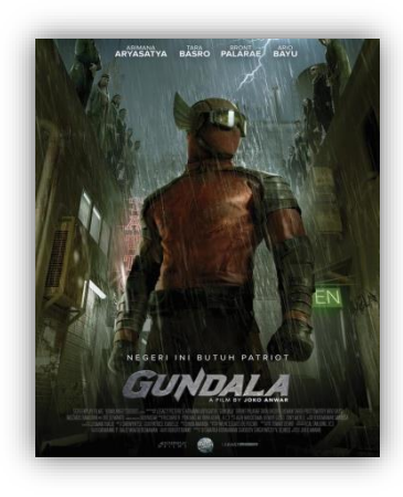
Figure 9. Remake of Gundala Movie in 2019 by Joko Anwar