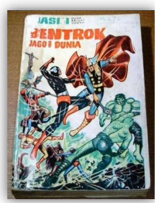
Figure 1: The depiction of a crossover between Indonesian superheroes and American superheroes in the 1970s in some of the Gundala Putera Petir comics by Hasmi

The concept of combining various superheroes in a story such as that created by Marvel in Secret Wars (1985) and Civil Wars (2006-2007) had been done by Indonesian comic artists during the heyday of Indonesian comics around 1960-1980s. Several superhero characters from America (Marvel and DC Comics) got combined together with Superhero characters from Indonesia. They were involved in a fierce battle in the Gundala Putra Petir comic entitled Bentrok Jago-Jago Dunia . This form of crossover was a common thing for Indonesian comic artists in the 1960-1980 era. This was done because the interest of Indonesian people towards western culture was very strong, so the step of combining the characters of superheroes from America and Indonesia was an effective strategy of Indonesian comic artists to attract the interest of their readers.