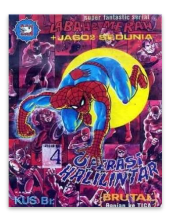
Figure 2: the concept of original, borrow and traditions of Labah-Labah Merah by Kus Bram in the 1969s which is inspired by Spiderman from Marvel Universe