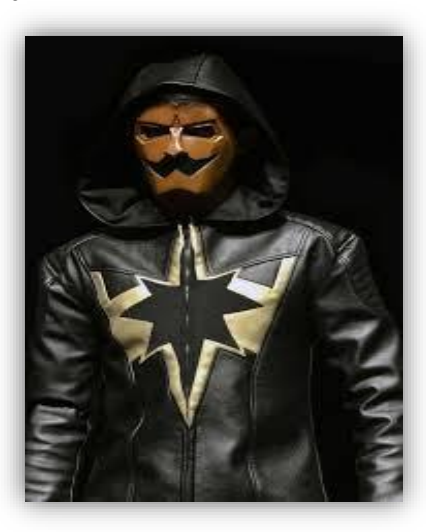
Figure 11. Modern Concept of Gatotkaca by Charles Gozali