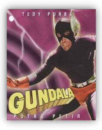
Figure 8.1st Gundala Movie in 1981 by Lilik Sudjio