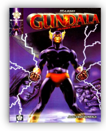
Figure 7. Initial Concept of Gundala by Hasmi

The pictures below show the transition process of the Gundala character from the initial concept to the most modern concept: