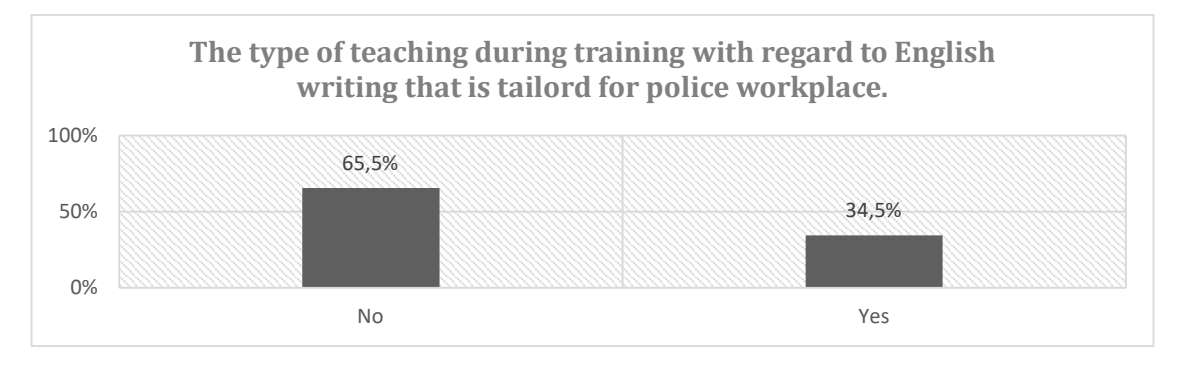
Figure 3. The type of pedagogy in SAPS training program

Investigative subjects were also requested to specify if they were content pertaining to type of pedagogy they were exposed to in relation to English writing. In reaction to the question, 133 (65.5%) replied by maintaining that the teaching did not satisfy them because it did not help them develop an satisfactory English writing ability that is well matched for a police workplace. During this investigation, they protested that the pedagogy was not 'understandable' and 'interesting'. The findings conversed in the above paragraph are shown in Figure 3.