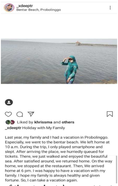
Figure 4. One of the students' recount texts in Instagram

mauliya.avivi Dea, please give title on your writing. Well, it still needs more sentences to make it better to read. Keep spirit.