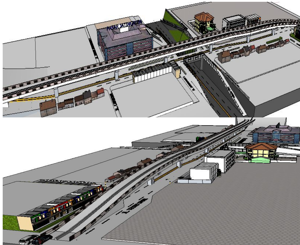
Figure 3. The basic design Jatingaleh Fly Over Semarang

With the results of the calculations can be made a basic design Fly Over to increase the number of road capacity as follows :