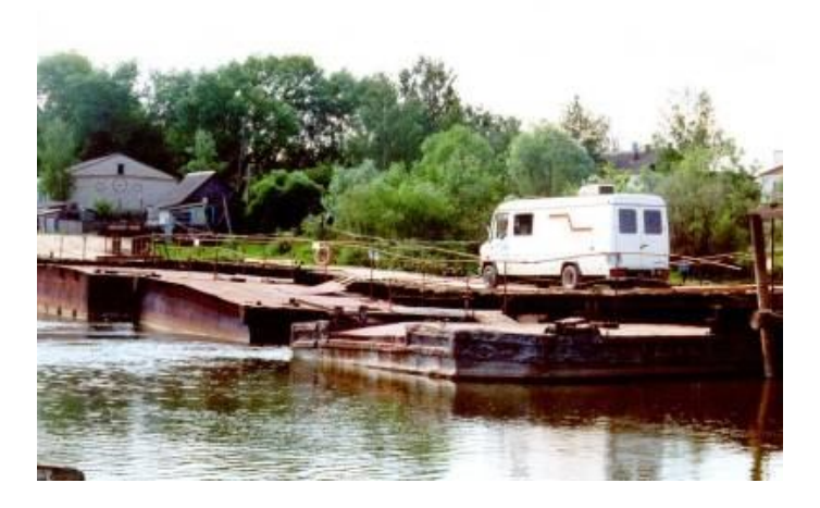
Fig. 1. Pontoon foundation with bridge decks

This research was aimed to introduce pontoon foundation with bamboo frame with the size of 2 X 2 X 2 m3 like in Figure.2 that the cover was made of tarpaulin gutter [10]. Bamboo and tarpaulin were used due to being affordable, renewable and easily obtained. No choice of diameter and bamboo type, this was because the availability on the materials were varied. For connecting the angles among the bamboos, hemp rope was selected.