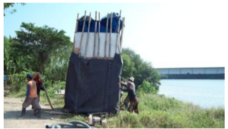
Fig. 3. The pontoon was inserted into the swamp [10]

After the bottom of pontoon reached the bottom of swamp, then the pontoon became stable, floating force was mobilized by reducing the water height in the pontoon holes (space B). In this research measurement of every water load variation, water volume variation in the pontoon hole is presented by the water height in the upper box (space A), the water height in the lower hole (space B).