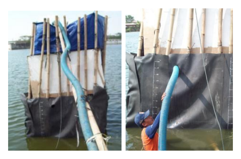
Figure 4. All instrument was installed to the pontoon and sinking process of pontoon [10]

After the bottom of pontoon reached the bottom of swamp, then the pontoon became stable, floating force was mobilized by reducing the water height in the pontoon holes (space B). In this research measurement of every water load variation, water volume variation in the pontoon hole is presented by the water height in the upper box (space A), the water height in the lower hole (space B).