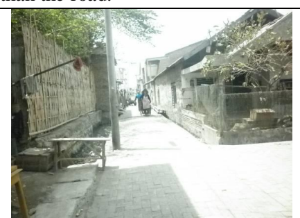
Figure 8. Paving road conditions

Tambak Lorok road conditions still need much improvement. Almost all the way there is of paving or soil. And because people do not understand, then they lifted up the road together so that the streets are not flooded. However, it will make their home will be lower than the road.