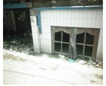
Figure 14. The house should be abandoned because it was submerged by water