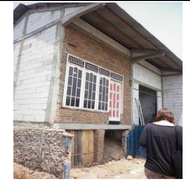
Figure 13. One of the houses to be elevated due to a decrease in soil

Land subsidence in Tambak Lorok is very bad, even the people who live there have to elevate his home on average 2 to 3 times per 5 years. Even then if they have the money to renovate their homes.