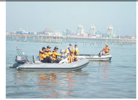
Figure 19. Escort of navy