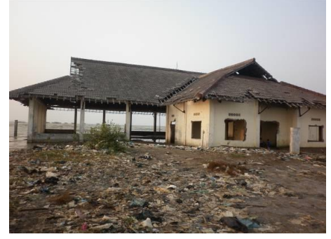
Figure 16. New TPI