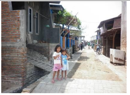
Figure 21. Child playing with friends on the road

Social problems in Tambak Lorok are the main ones for children. There is no place that can be used as a location to play. So the kids just playing in front of the house, on the street.