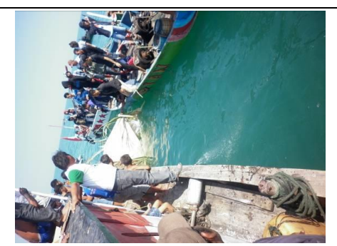
Figure 20. The main activities

Social problems in Tambak Lorok are the main ones for children. There is no place that can be used as a location to play. So the kids just playing in front of the house, on the street.