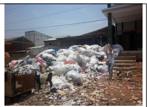
Figure 11. Sewage treatment by one of the residents