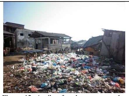
Figure 12. A pile of garbage next to the house