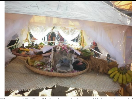
Figure 17. Buffalo head that will be placed in the middle of the sea

Culture of Tambak Lorok until now is "Sedekah Laut", ie by placing the head of a buffalo with a few other materials in the sea, exactly 2 hours if passed by a fishing boat. It is intended as a form of gratitude for the sea.