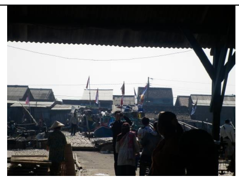
Figure 15. Old TPI

Tambak Lorok has two type. Namely the new TPI and old TPI long. Old TPI is still used by the community, but the new TPI is now no longer used, because submerged by seawater.