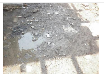
Figure 9. Dirt road conditins