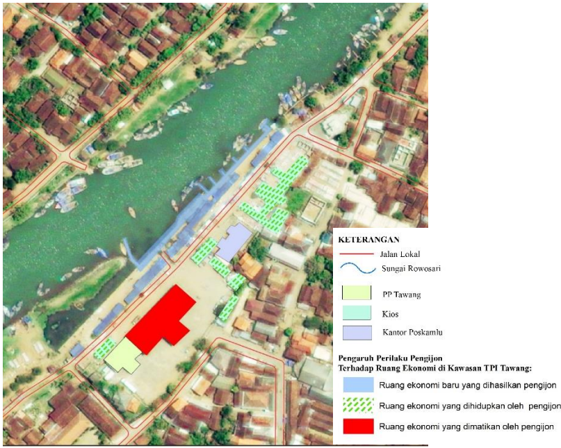
Figure 5: Economic Space Map at TPI Tawang