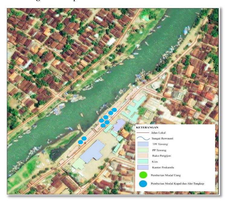
Figure 1: Map of Middleman Observation Locations