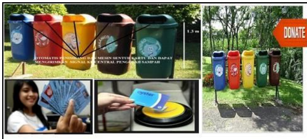
Fig. 2. Automatic Waste Box and Smart Card System

In addition to the above three disadvantages, UNISSULA does not have a smart card system that is combined Automatic Container System that allows the owner of the garbage every time you enter the garbage in the container, the card will automatically fill the voucher of the heavy amount of garbage. If the above concept is applicable, it can solve some problems easily. Smart cards combined with automatic container system are drawn as follows: