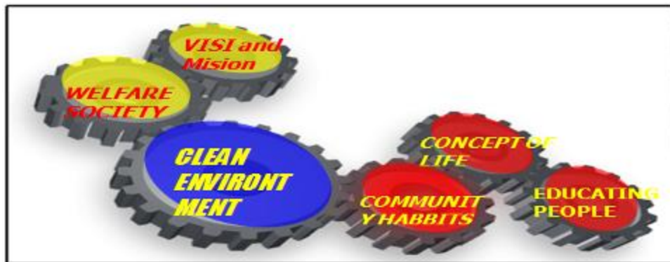
Fig. 5. Change of Waste Management Concept

Change of waste management include Visi and Mission, Welfare Society, Clean Environment, Community Habbits, Concept of Life and Education People described as follow: