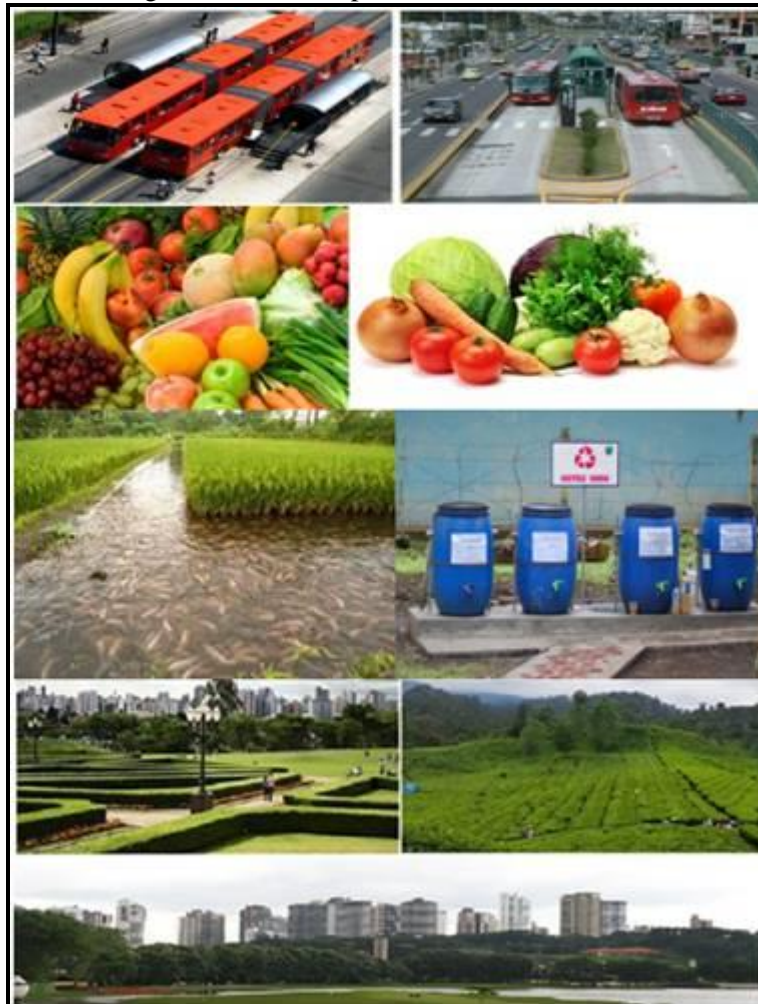
Fig. 3. Benefits of Collecting Waste

Secondly: The results of garbage collection stored in smart card can be used for everyday purposes, i.e: (a) For transportation (commuter, BRT, Busway payments), (b) For the student the smartcard can be used to pay tuition fee, (c) For college students can use it for laptop purchase installment as it has been run in Brazil, (d) For housewives can use it to buy fresh fruits, vegetables, rice and fish produced from gardens and land managed from this concept, (e) In terms of energy, farmers can be helped by the cheap price of compost fertilizer produced from this concept. While the mechanism of waste management into organic fertilizer depicted as follows: