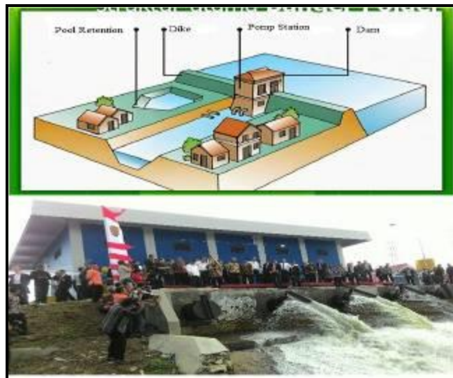
Fig. 7. Sustainable Pump System