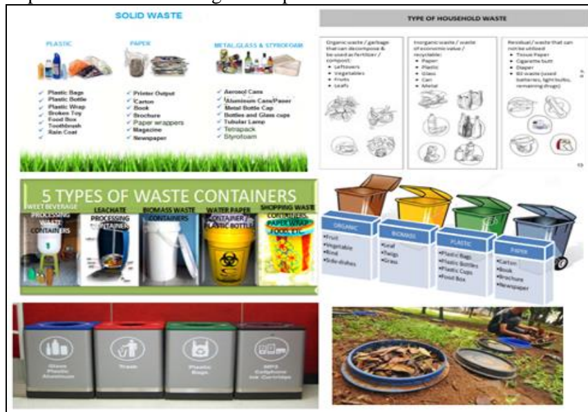
Fig. 1. Waste Separation and Processing

Waste Separation and Processing will depicted as follow: