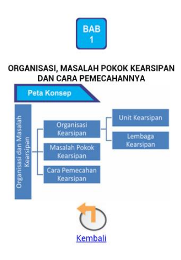
Figure 3. Concept Map