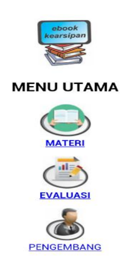
Figure 2. Main menu of E-book